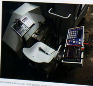
NIK NOWAK, Panzer 2011, Mini dumper, sound, mixed media, www.nowak.com

“Pulstar takes inspiration from the christening of his Panzer tank, a caterpillar-tracked sound system steered by Nowak from a sonic control cockpit. A champagne bottle is smashed against the hull, and the tank is jerked out of its sub-bass snoring. System startup begins with menacing digital crackle and hum, until a tiny piano sample zippers in some barbarian hip-hop beats amid a flurry of skip-tracer loops and noise shrapnel. Finally the jetitive fires up as the Panzer starts its mission. US tank drivers in the Middle East crank out Death Metal in their cabs while on duty; Nowak’s metal music machine generates its own brutalising aural assault.” Rob Young